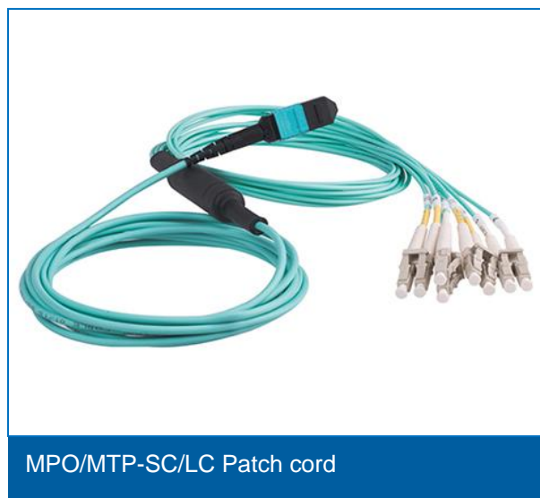
MPO/MTP-SC/LC Patch cord